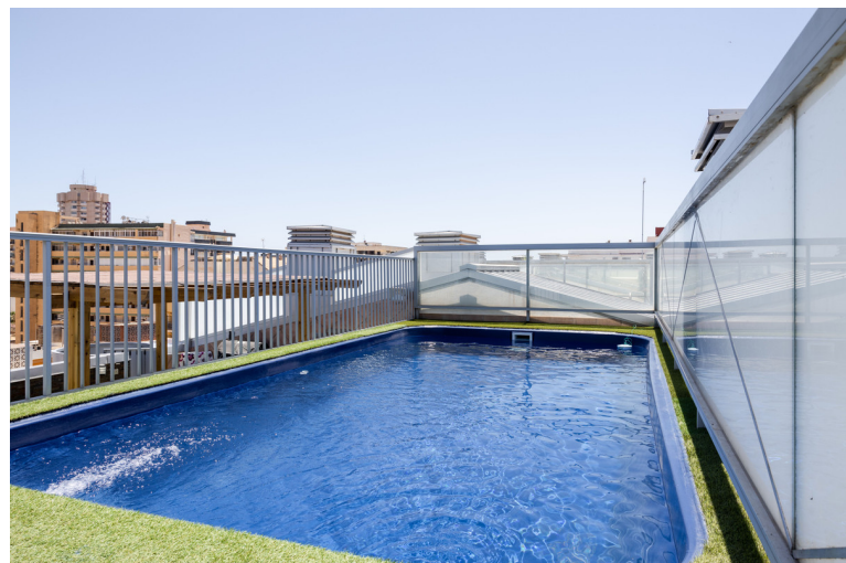
ZES AND DIMENSIONS ARE APPROXIMATE, ACTUAL MAY VARY.